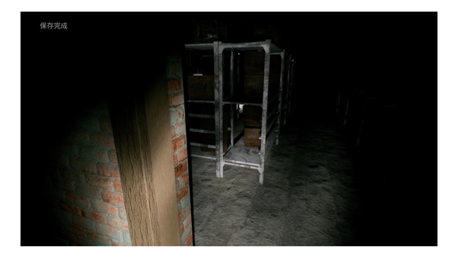
Long Z-Night Patch

Download ->>> <a href="http://bit.ly/2NJUZ0L">http://bit.ly/2NJUZ0L</a>